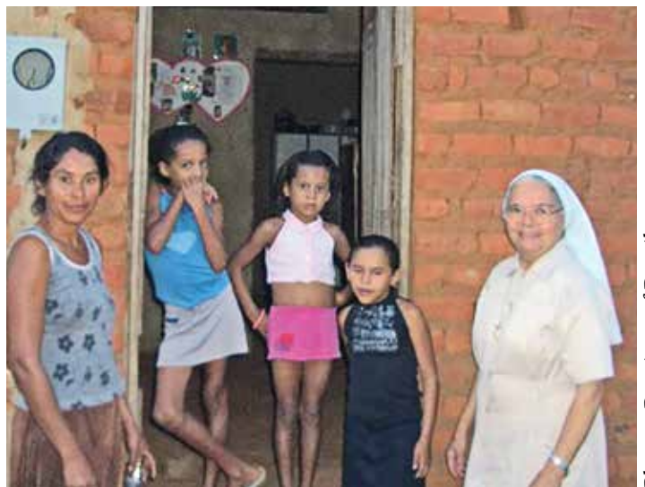
Nutrition, education and religious education