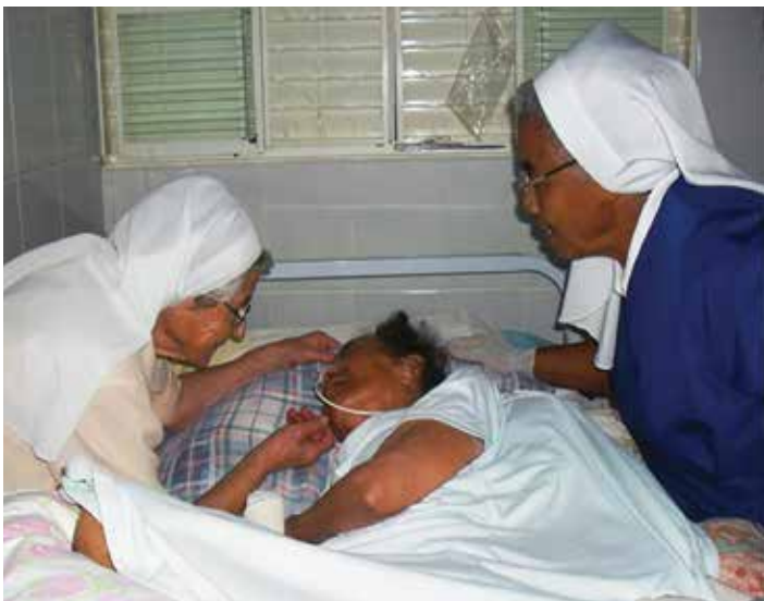
Recovery center for drug dependent women