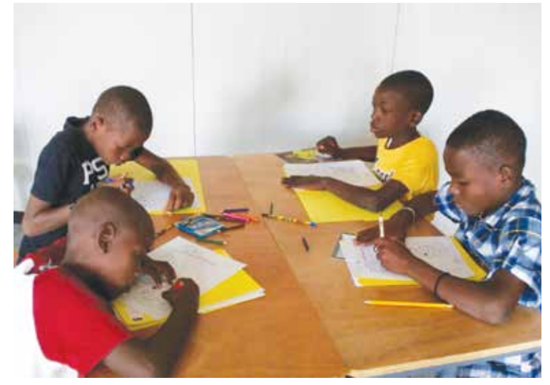
Small group learning environment

The project is being supported by the DCC (a delegation of professionals in Paris supporting cooperative projects). The group hired two teachers