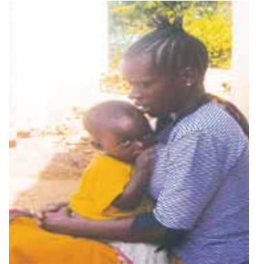
Mother and child at the clinic.

Health care and pastoral and social outreach to the poor children at Village President and to those addicted to alcohol/drugs are the major ministries in the Seychelles. Some sisters teach catechism in the schools and parishes. Others are engaged in active listening at La Domus and in counseling and pastoral visits to the sick in hospitals and at home.