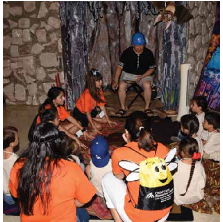
Moving from the darkness of the cave into the Light of Christ

Along with the songs, Bible stories, crafts, games, and videos integrated this invitation to bring the Light of Christ into the darkness of our world. Even the snacks (grapes shaped into a glowworm, popcorn wrapped and tied to resemble a butterfly) highlighted the theme.