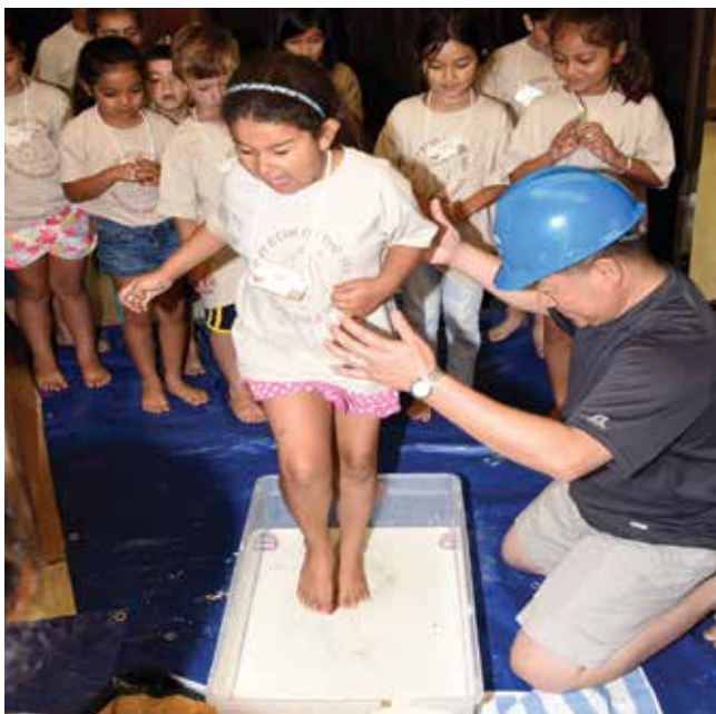
Walking on water

All in all, Mary Star's VBS was another huge success!