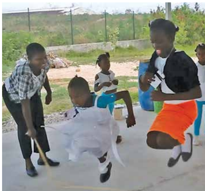
Time for fun and exercise, too!