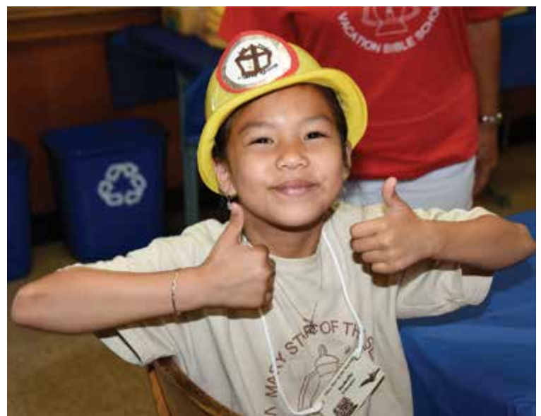
It was a great week!