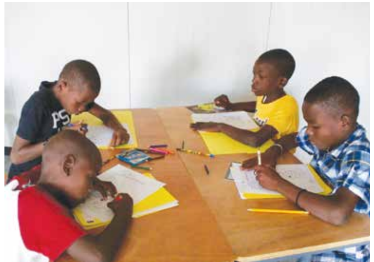
Small group learning environment

The project is being supported by the DCC (a delegation of professionals in Paris supporting cooperative projects). The group hired two teachers