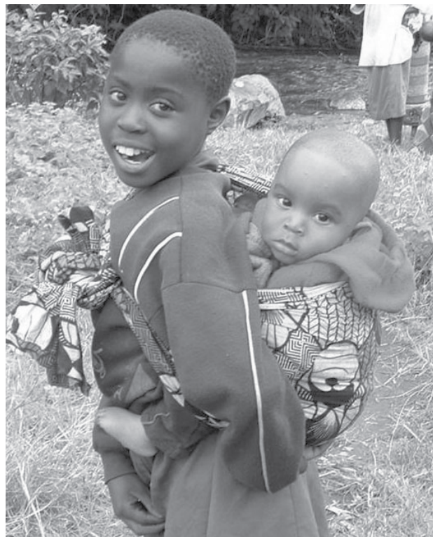
A Tanzanian girl with her sister.

In February 2007 the sisters had the joy of having their first Tanzanian,