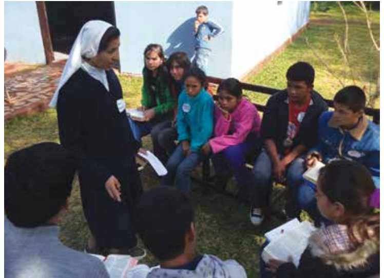
A sister working with a group of teenagers.

In Paraguay, as in so many places, the scourge of human trafficking has taken on epidemic proportions, destroying the lives of women, adolescents and children. To address the issue, the sisters began by educating themselves through a variety of contacts with specialists in the field. The next step was to study the reality of the local scene. The ravages of trafficking are immense, especially among the poor. It is not possible to address them all at one and the same time. The sisters opted to focus on the most vulnerable: young children and high-risk adolescents caught in the web of drug trafficking and addiction. Again, education is key and women have always known that the best way to the mind and heart is through the stomach! So, enticing nutrition programs are paired with educational activities that empower youths to resist drugs, prostitution, pornography and child abuse. Job training for teens helps them find work, yet another very important barrier to victimization.