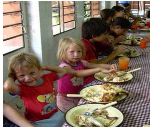
Children eating at the canteen.

For Cluny Sisters in Paraguay/Argentina, that the light Pope Francis has been shining on the very work in which they have so long been engaged is a blessing and an encouragement!