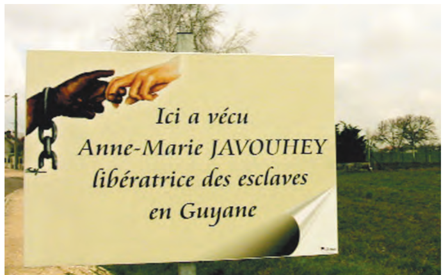
Here lived Anne-Marie JAVOUHEY, liberator of the slaves in Guiana Sign at the entrance of the village of Chamblanc.

SC: We have a co-ed secondary school also. None of us work full time in the