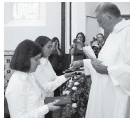
Two women recently pronouncing vows as Cluny Sisters in the Province of Portugal.

For more information, please see: www.sjclunyportugal.com .